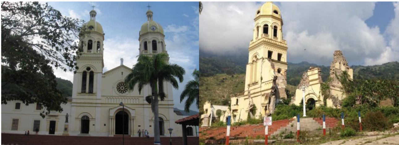
Figure 2. Municipal head- Gramalote's central park. Before and after the disaster